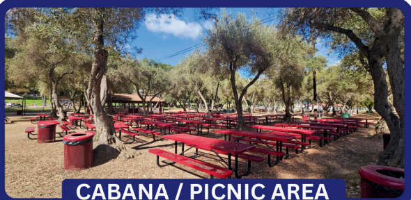
CABANA / PICNIC AREA

*These fees are effective for events happening on June 2025 and onward