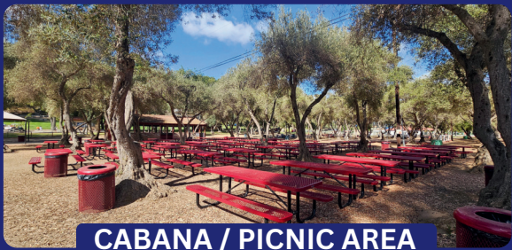
CABANA / PICNIC AREA

*These fees are effective for events happening on June 2025 and onward