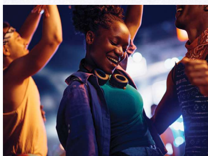
SUMMER FEST AT PACIFIC BEACON