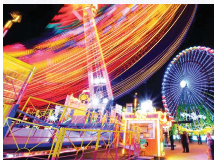
SAN DIEGO COUNTY FAIR TRIP

E1-E6 ACTIVE DUTY & GEO BACHELORS ONLY. NO GUESTS UNDER 18 YEARS OLD.